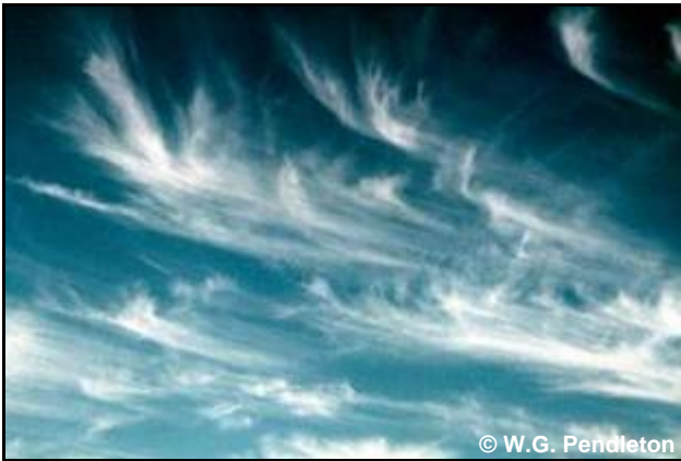
Figure 36. Cirrus uncinus .