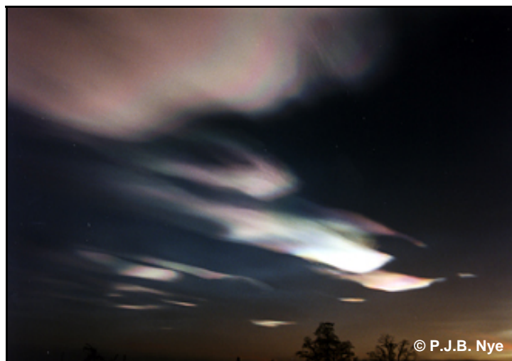
Figure 50. Nacreous Cloud.