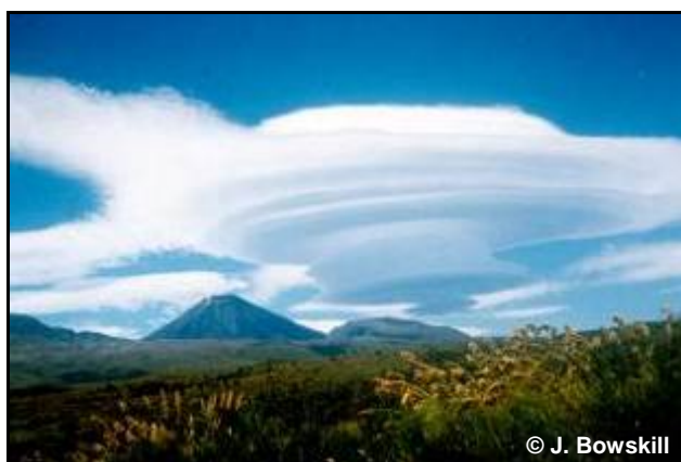
Figure 53. Orographic cloud, Mount Ruapahu, New Zealand.

Cloud which is formed by forced uplift of air over high ground. The reduction of pressure within the rising air mass produces adiabatic cooling and, if the air is sufficiently moist, condensation. Lenticular wave clouds, including those formed well to leeward of the high ground, are common orographic clouds; stratus, cumulus and cirrus clouds are also sometimes orographic in origin.