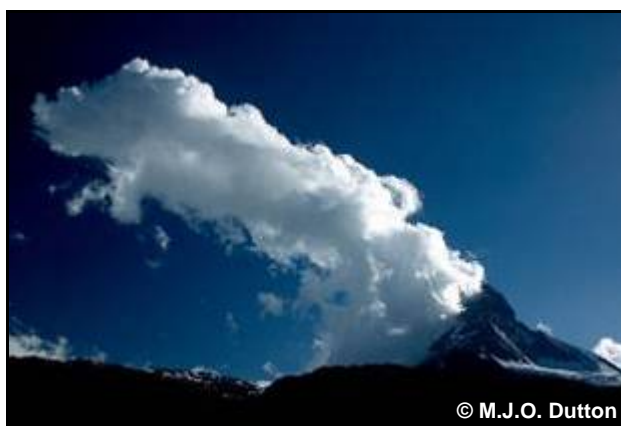
Figure 54. Orographic cloud, Matterhorn.