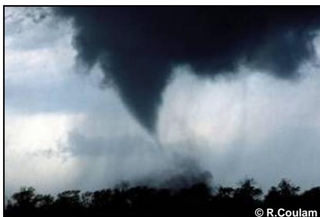
Figure 46. Tuba.