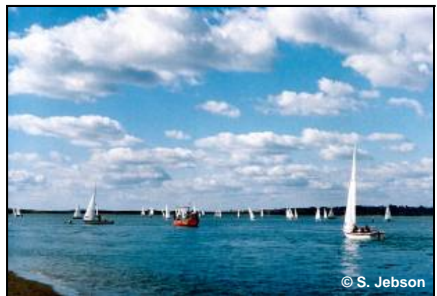
Figure 17. Cumulus humilis .