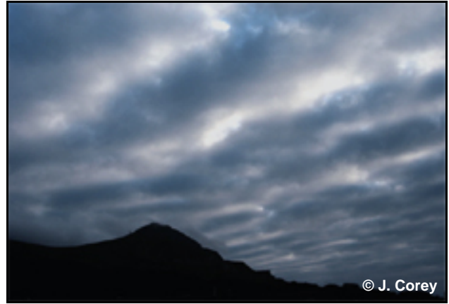
Figure 15. Stratocumulus stratiformis .