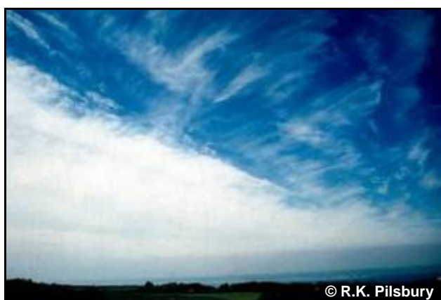
Figure 31. Cirrostratus nebulosus .