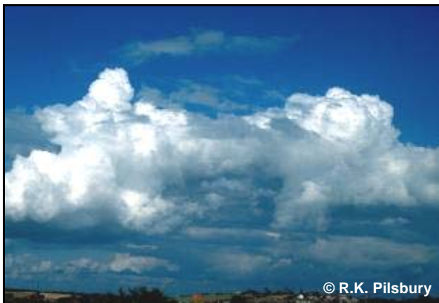
Figure 18. Cumulus mediocris .