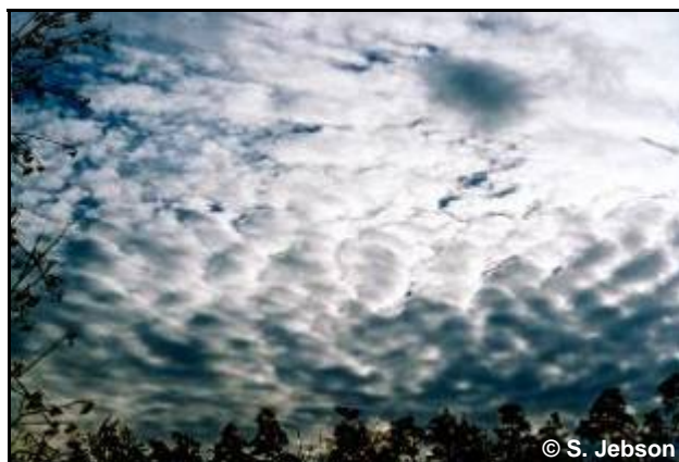
Figure 26. Altocumulus stratiformis .