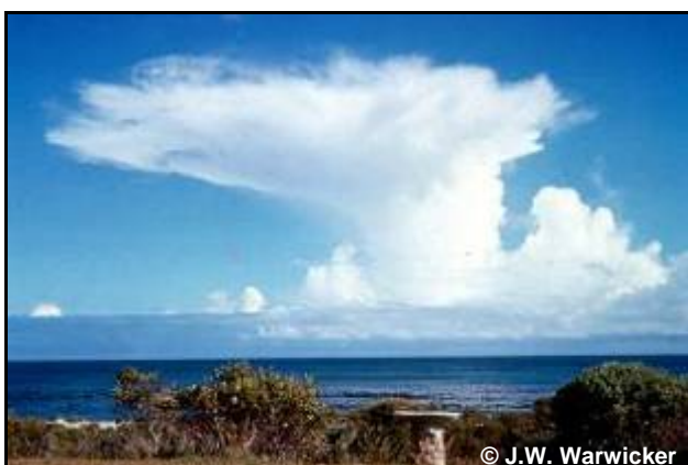
Figure 45. Incus.