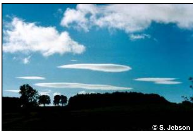
Figure 27. Altocumulus lenticularis .