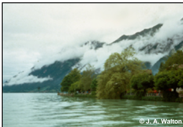
Figure 11. Stratus fractus .