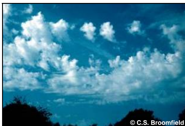
Figure 28. Altocumulus castellanus .