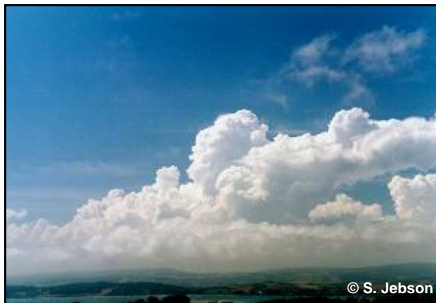
Figure 19. Cumulus congestus .