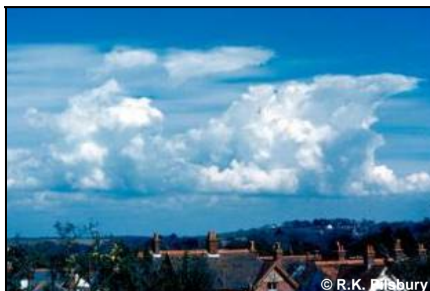
Figure 30. Altocumulus cumulogenitus .