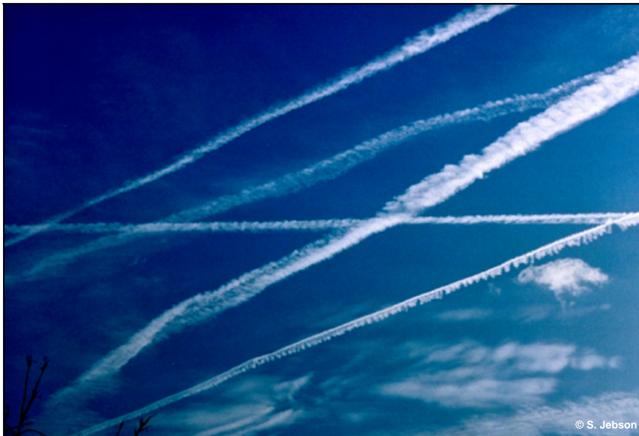
Figure 55. Contrails.

An initially thin trail of water droplets or ice crystals produced by an aircraft engine exhaust when the humidifying effect of the water vapour exceeds the opposed heating effect of the exhaust air (exhaust trail). Such trails generally broaden rapidly and evaporate as mixing with drier air proceeds; when the atmosphere is already moist, however, they may be very persistent.