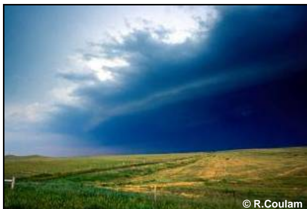
Figure 44. Arcus.