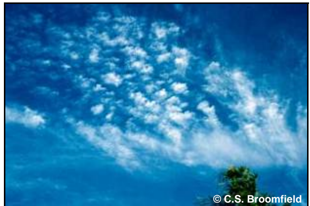
Figure 39. Cirrus floccus .