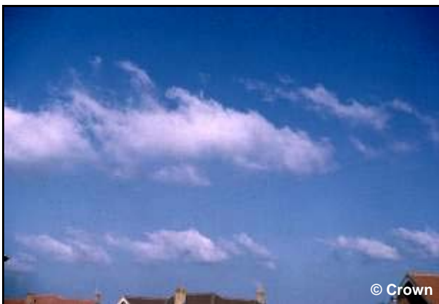
Figure 16. Cumulus fractus .