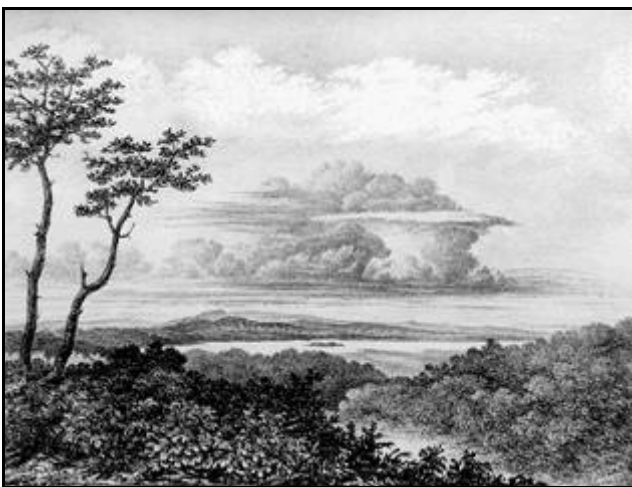
Figure 6. Cumulostratus as produced by the inosculation of cumulus with cirrostratus. Cirrus above, passing to cirrocumulus.