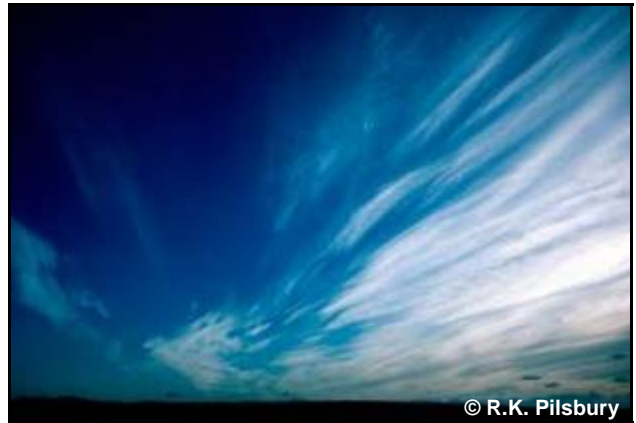
Figure 37. Cirrus fibratus .