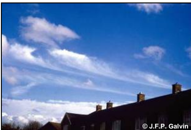
Figure 40. Cirrus castellanus .