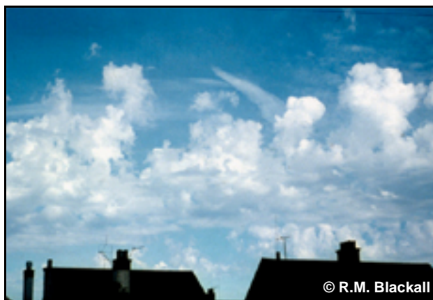
Figure 13. Stratocumulus castellanus .