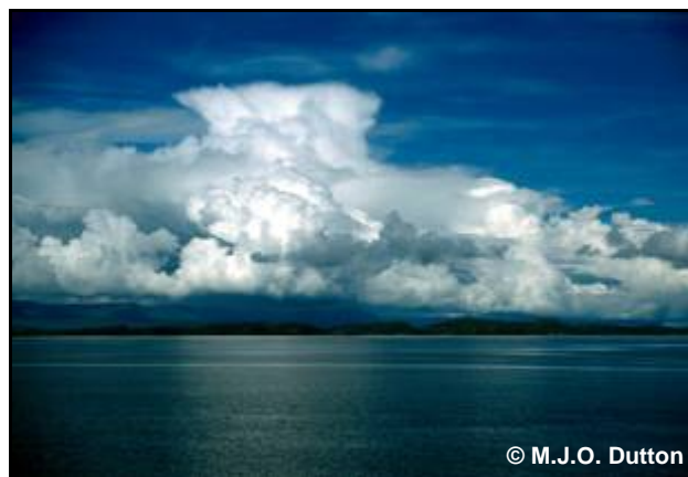
Figure 21. Cumulonimbus capillatus .