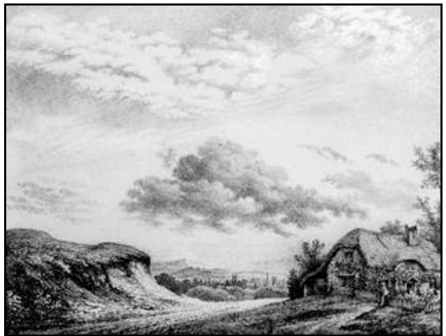
Figure 5. Cumulus breaking up, cirrus and cirrocumulus above.