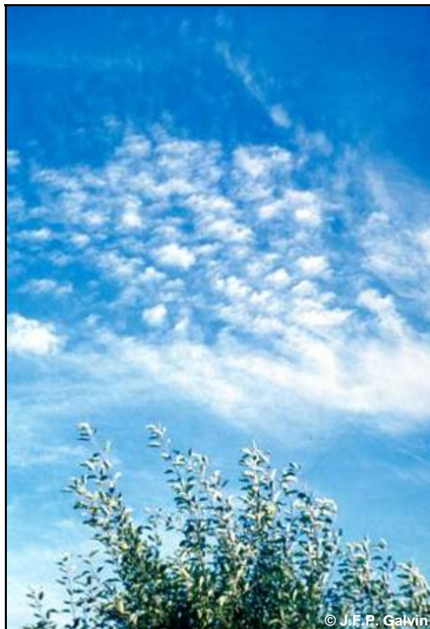
Figure 35. Cirrocumulus floccus .