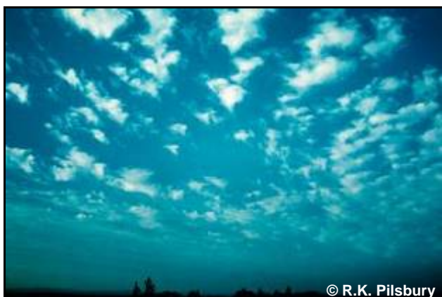
Figure 29. Altocumulus floccus .