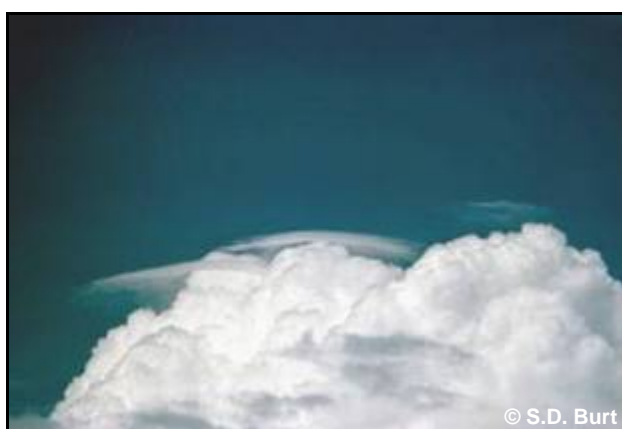
Figure 48. Pileus.