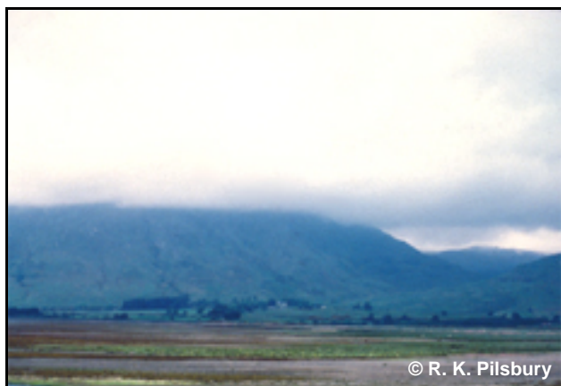
Figure 10. Stratus nebulosus .