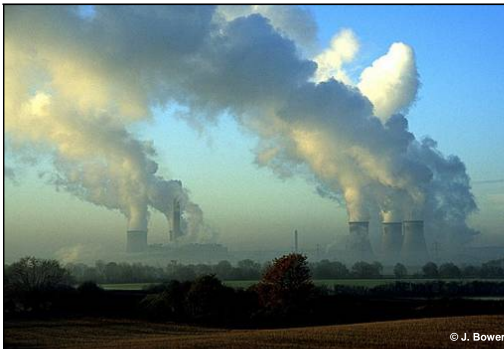
Figure 52. Pyrocumulus forming over Didcot Power Station, Oxfordshire.

A term sometimes given to the cumulus cloud that forms over an intense source of heat on the ground, such as a power station or a heath or forest fire. It does not form part of the official WMO cloud classification and is, in any case, an unhappy mixture of Greek and Latin.