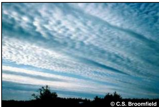
Figure 25. Altocumulus stratiformis .