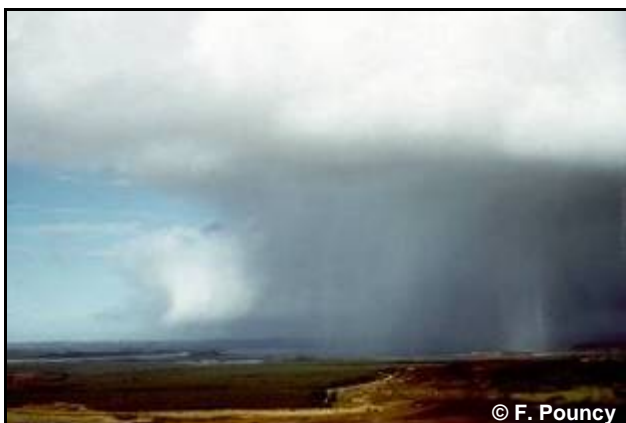
Figure 43. Praecipitatio.