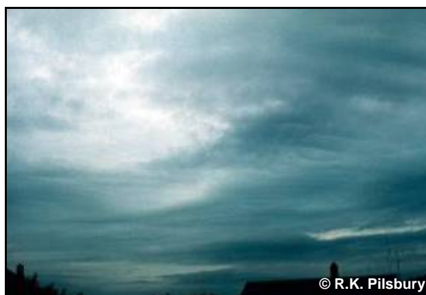
Figure 23. Altostratus opacus .