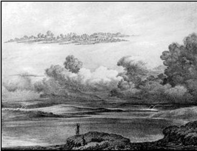
Figure 2. Forms assumed by clouds when gathering for a thunderstorm.

Below are examples of some of the illustrations depicted in Luke Howard's book entitled The Modification of Clouds .