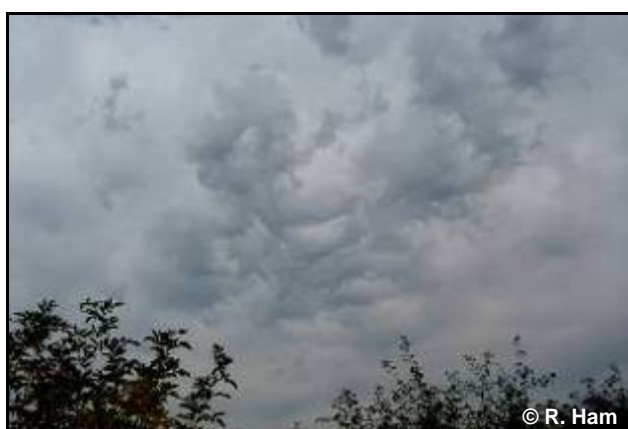
Figure 47. Pannus.

An accessory cloud veil of great horizontal extent, close above or attached to the upper part of one or several cumuliform clouds which often pierce it. Velum occurs principally with cumulus and cumulonimbus.