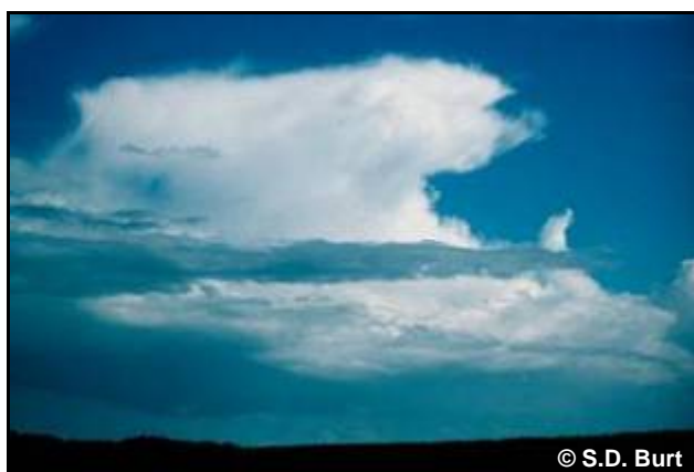
Figure 49. Velum.