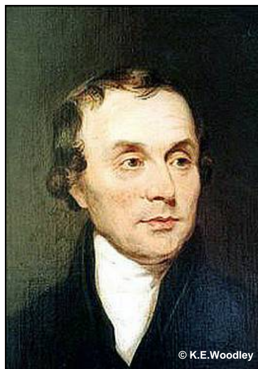
Figure 1. Luke Howard (1772 - 1864).

A new International Cloud Atlas was published in two volumes in 1956 by the World Meteorological Organization (WMO).