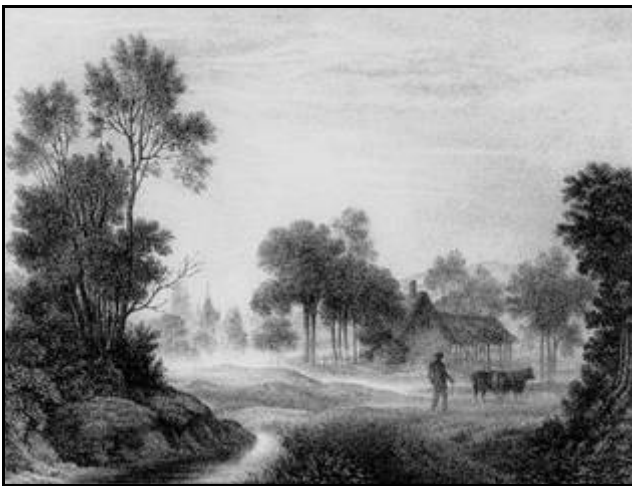
Figure 4. Stratus or ground fog.