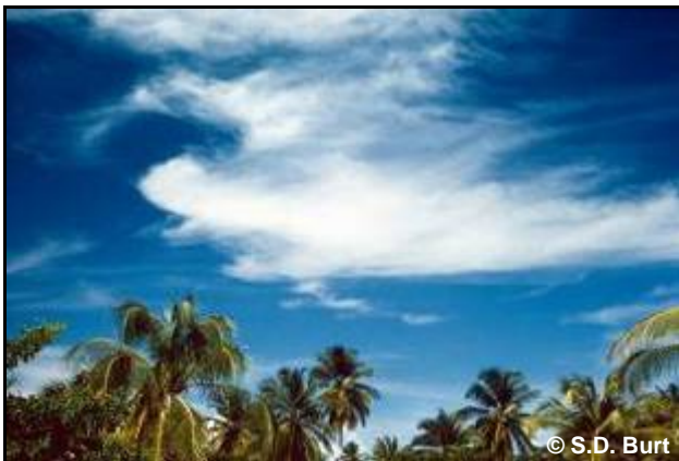
Figure 38. Cirrus spissatus .