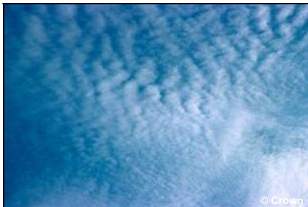
Figure 33. Cirrocumulus stratiformis .