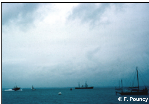
Figure 24. Nimbostratus.