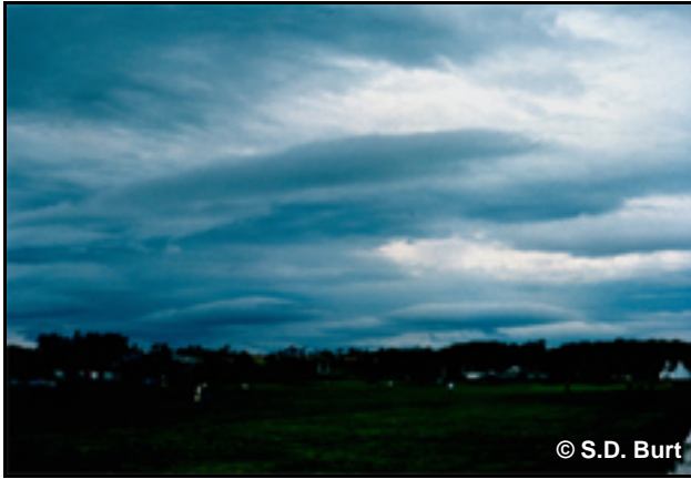
Figure 14. Stratocumulus lenticularis .