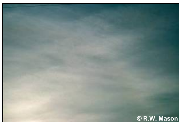
Figure 32. Cirrostratus fibratus .