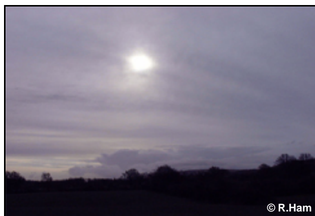
Figure 22. Altostratus translucidus .