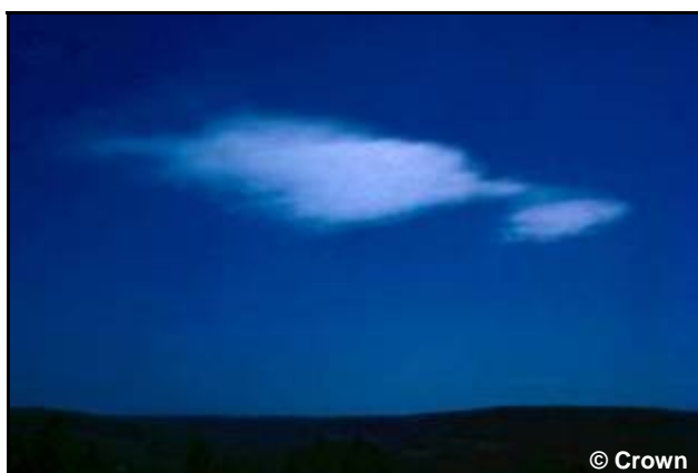
Figure 34. Cirrocumulus lenticularis .