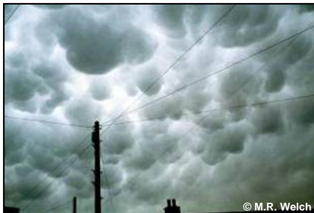
Figure 42. Mamma.