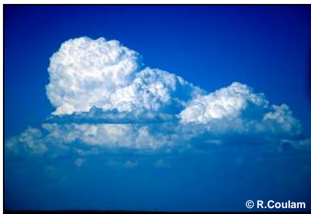
Figure 20. Cumulonimbus calvus .