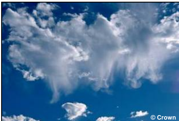
Figure 41. Virga.

Cloud column or inverted cloud cone (funnel cloud) protruding from a cloud base; it constitutes the cloudy manifestation of a more or less intense vortex. This supplementary feature occurs with cumulonimbus and, less often, with cumulus. The diameter of the cloud column, which is normally of the order of 10 metres, may in certain regions occasionally reach some hundreds of metres.