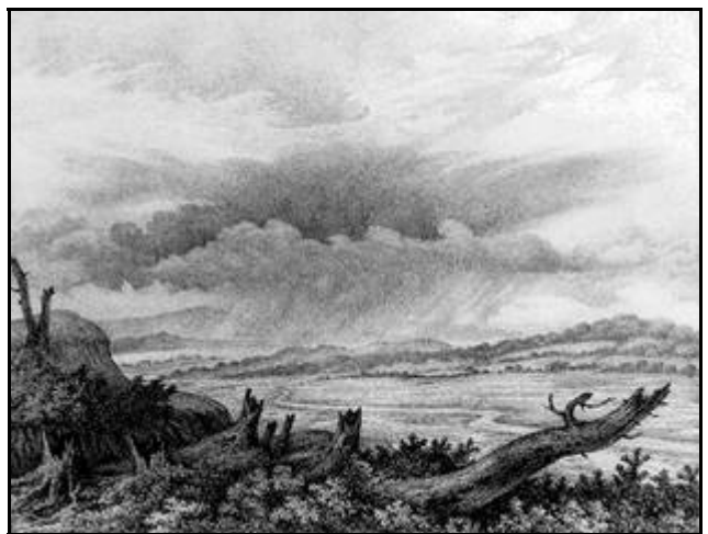
Figure 7. Nimbus or rain cloud.