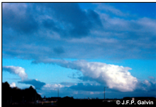
Figure 12. Stratocumulus cumulogenitus .