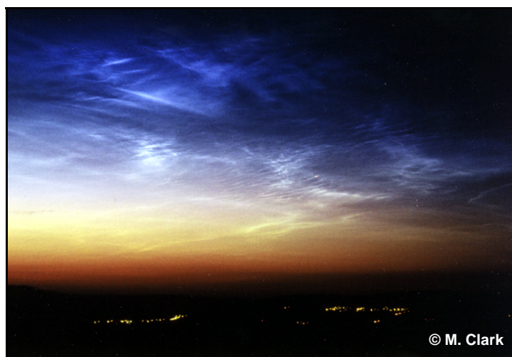
Figure 51. Noctilucent Cloud.

Noctilucent clouds usually appear in the form of thin cirrus-like streaks, sometimes only one or two isolated filaments being visible while at other times the cloud elements are closely compacted into an almost continuous mass resembling cirrocumulus or altocumulus. Noctilucent clouds can usually be distinguished from ordinary clouds by the fact that they remain brighter than the sky background and glow with a pearly, silvery light, generally showing tinges of blue colouration.